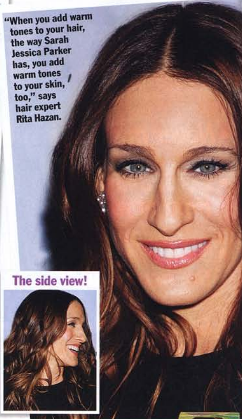
The side view!