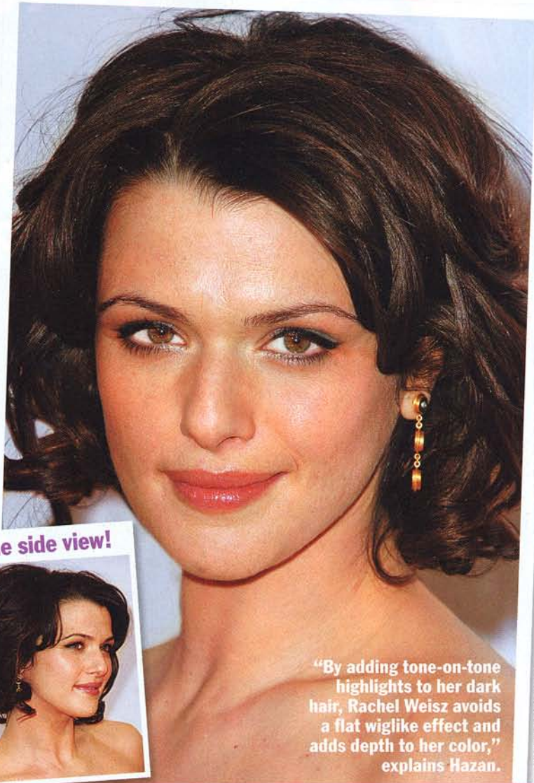
The side view!